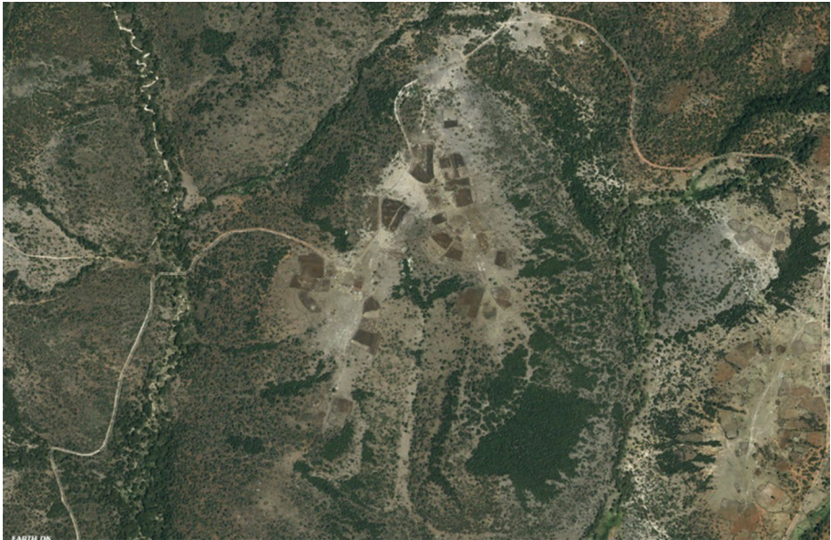
Fig. 2 Satellite image of settlements in the Loita area showing the unpaved dry-season access roads, the settlement surrounded by an open area where the vegetation has been overgrazed (light brown) and several cultivated land parcels (dark brown, straight sides), all embedded in a matrix of dry bush land with scattered shrubs. Areas with denser vegetation can be seen along the stream valleys.